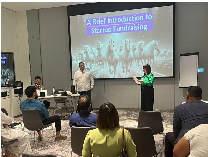
Startup Fundraising by Saad Ansari